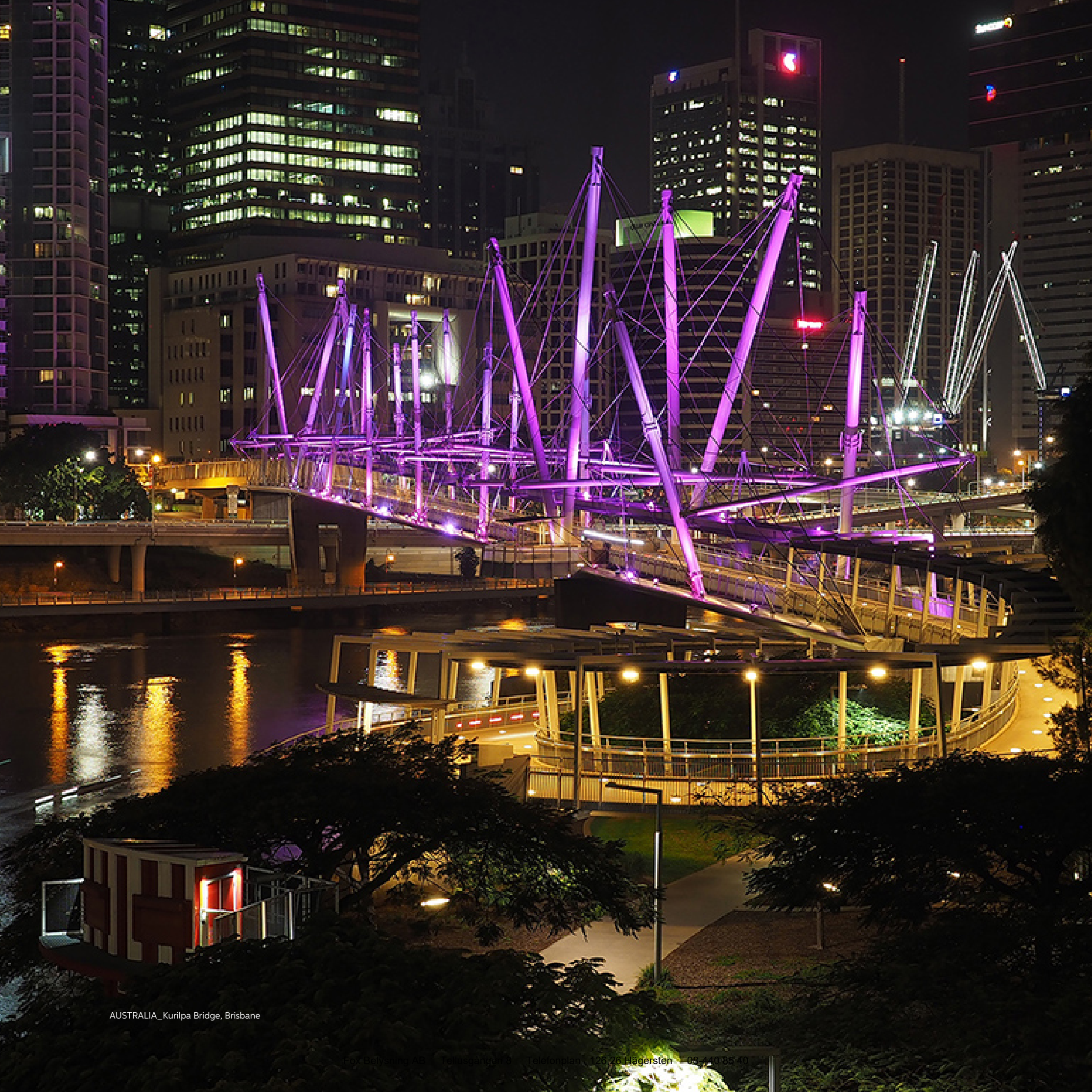
AUSTRALIA_Kurilpa Bridge, Brisbane